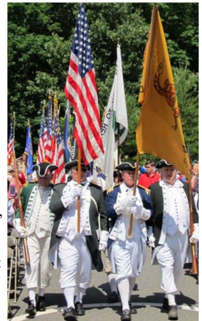
The Sojourners in Colonial regalia