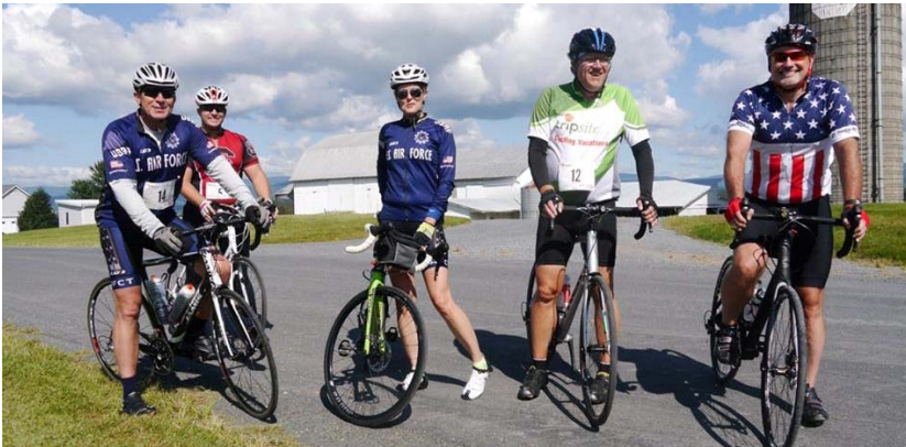
Above: Riders enjoy the beauty of the central Shenandoah Valley farmland. Below: