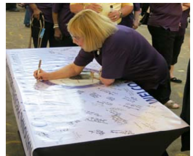
Signing Dee's banner