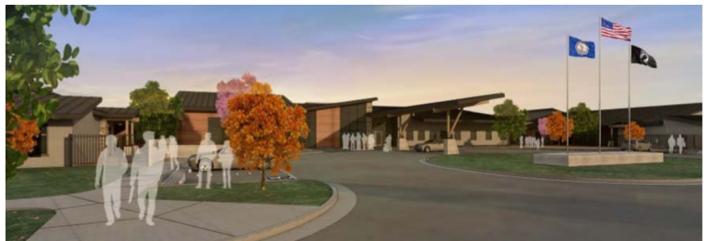
Artist's concept of the front entrance.