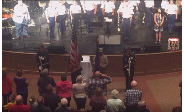
Posting the Colors at the Lincoln Theater