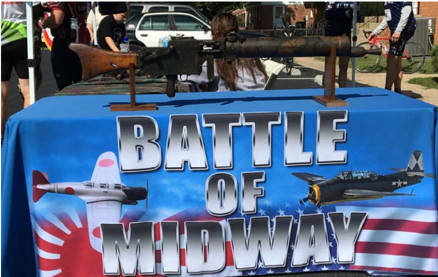
VFW Post 8644's exhibit at their rest stop representing the Battle of Midway, half-way through the 50 mile course.