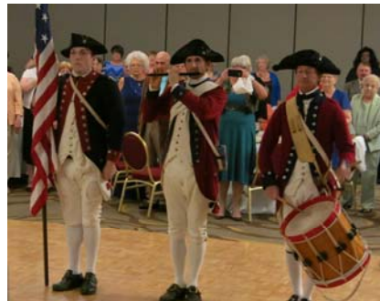
Fife & Drum Corps led opening ceremony