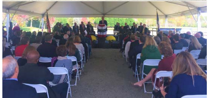
Twenty-two dignitaries participated in the groundbreaking ceremony.