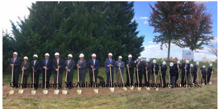
Governor Terry McAuliffe delivered the keynote address.

Scheduled for completion in early 2020, the Puller Veterans Care Center will be built on the former Vint Hill Farms Station in Fauquier County, which previously served as a United States Army and National Security Agency facility. The site played a critical role in eavesdropping on enemy communications during World War II, when it intercepted a message that helped lead to the D-Day invasion of Normandy. The new care center will deliver top-quality care to Virginia veterans in a home-like setting. The 128-bed facility will feature all private rooms that will be organized into households and neighborhoods that surround a central community center.