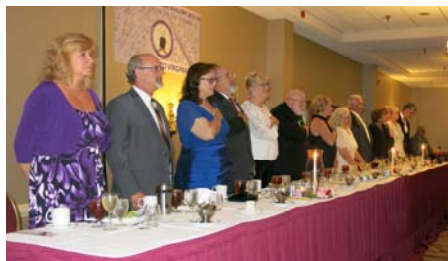
The head table at Saturday's banquet