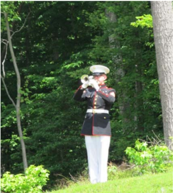
Left: A USMC Bugler plays "Taps"