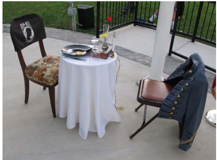
POW MIA Table of Honor on Display