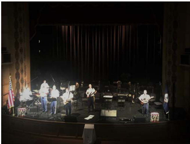
The Virginia Guard's Rock Band during intermission