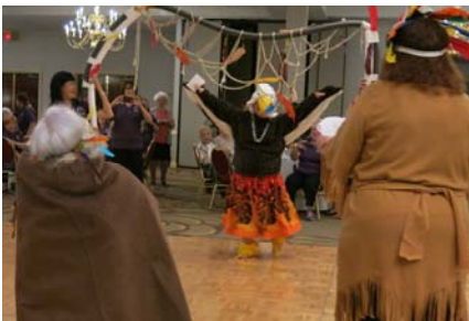
Native American dancers