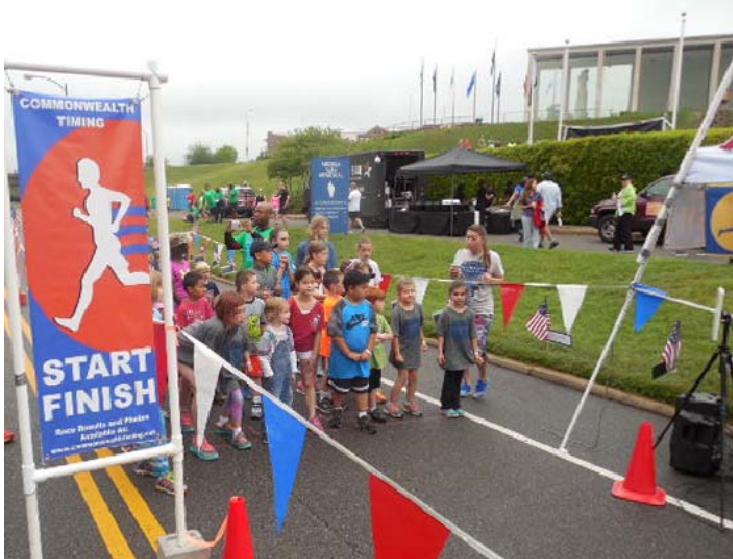
Every child who completed the event was awarded a medal as they crossed the finish line.