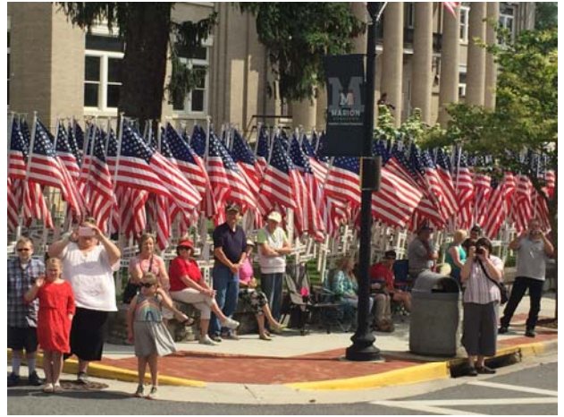
Over 1000 flags were displayed at the Smyth County courthouse; each one signifying a veteran who passed on.