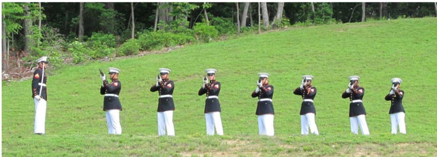
The “21-Gun Salute” was provided by the Marine Corps Rifle Team