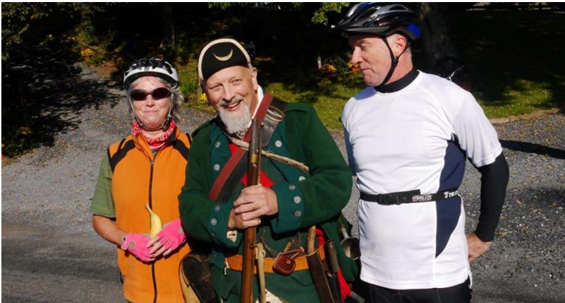
Two riders with a Revolutionary War re-enactor at the first rest stop.