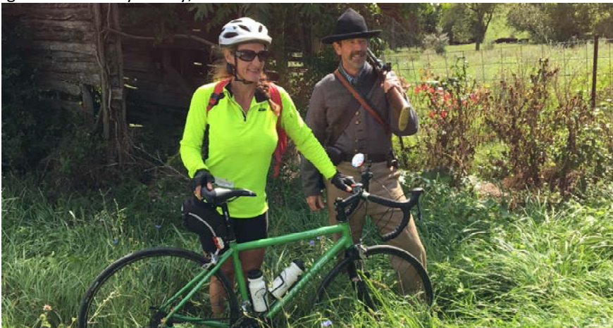
The 21st century meets the 19th century as a rider meets 10th Virginia Infantry re-enactor at the Jackson's Valley Campaign rest stop.