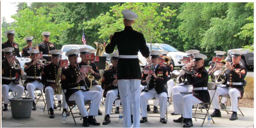
US Marine Corps Band played The National Anthem, the Medley of Service Hymns, and patriotic music throughout the ceremony