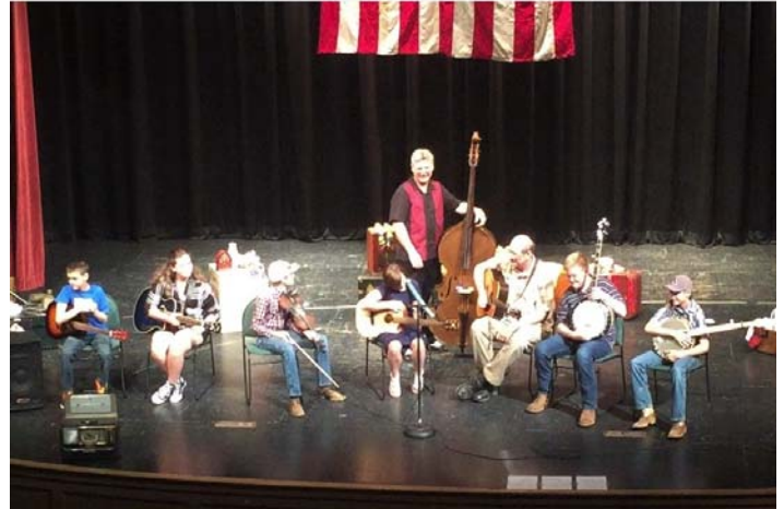
Student Bluegrass players joined their teachers onstage