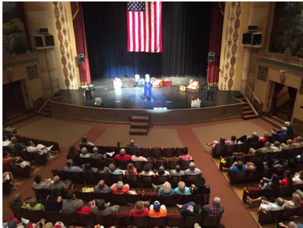
Letters From Home in performance