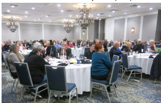
Opening ceremonies at the well attended annual awards banquet