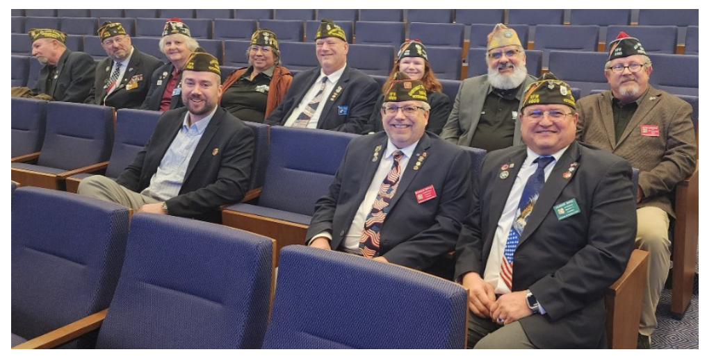
VFW members made a strong showing at a hearing at the House of Delegates