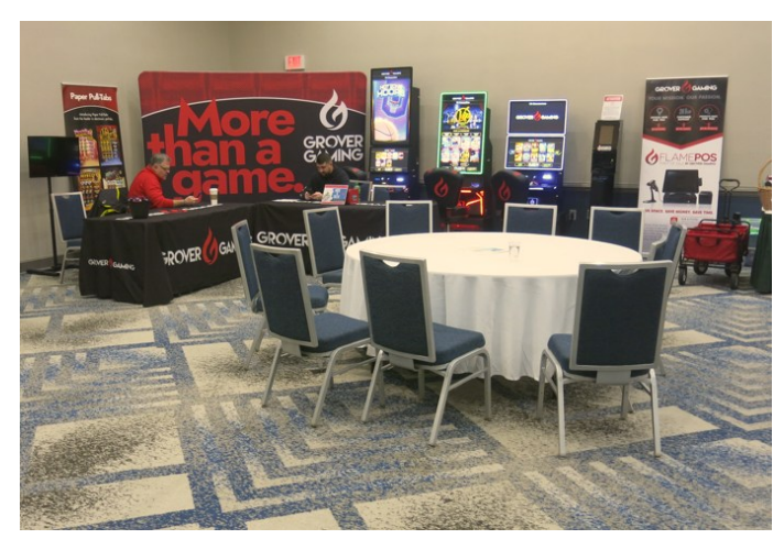
Several gaming vendors had displays of their latest offerings.