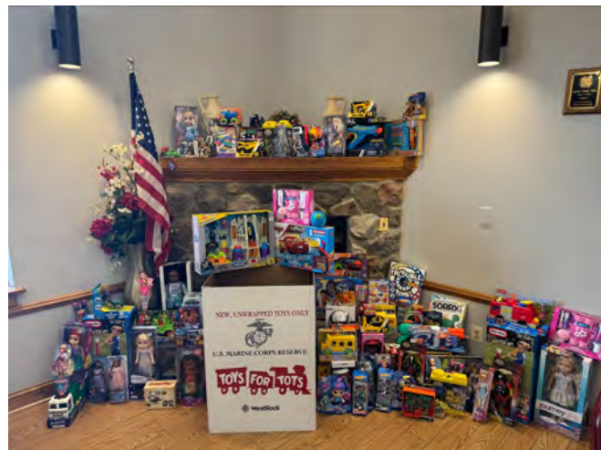
Post 1503 in Dale City had a successful Toys for Tots drive in the Northern Virginia, Dale City area.