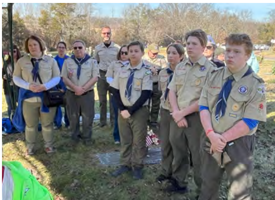
Crowd gathers for the ceremony