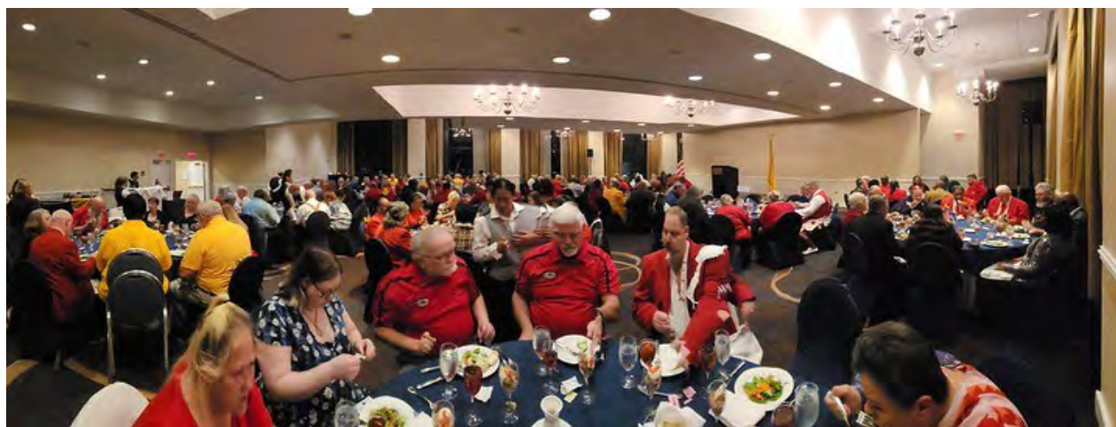
Pictured above and below, members of MOC & MOCA from all over the nation for Tomb Trek 2023