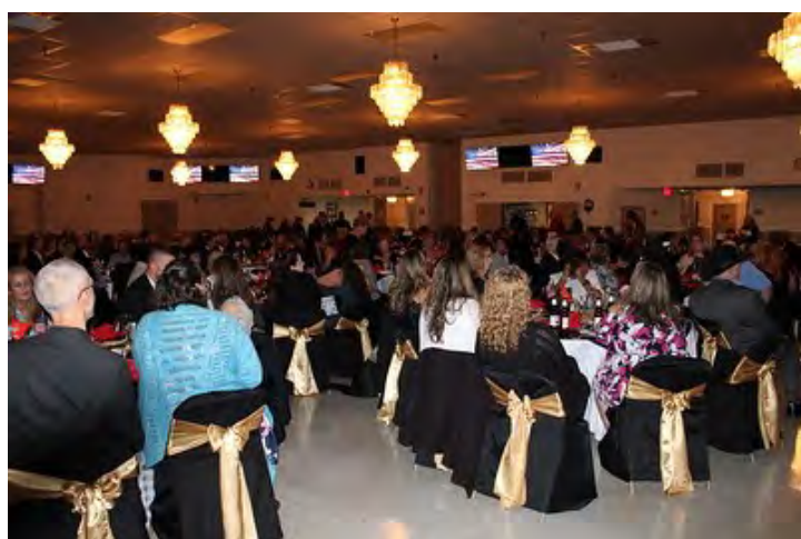
Post 1503 has a record crowd of over 300 participants at the 248th Marine Corps Birthday Ceremony on November 10th.