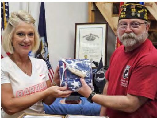
The Veterans of Foreign Wars