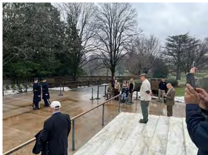
PHOTOS BY NOEL “NOGGER” LUMANOG, VFW POST 4809 AND CHRIS HAUTH VFW POST 8469