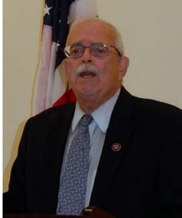
U.S. Representative Gerry Connolly

Next, Connolly said, “No conflict in history equaled what soldiers went through in WWI. In every way, until that point, we were unprepared. And today we witness the power of war begun by one, delusional man who doesn’t recognize Ukraine’s independence. The Ukraine people desire to do what we did – become free. It’s a battle between liberal, democratic values vs. authoritarianism – and we must win it.” So, continued Connolly, “As we celebrate and remember Veterans Day, we must also remember our country, its role in the world and how it can help others. Those veterans fought and died for the republic we were given in the Constitution of the United States. We pledge in the Constitution to be indivisible, and we’ve fought and died for that liberty.”