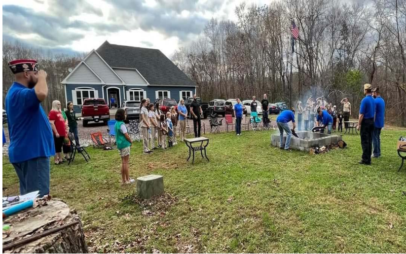
King George VFW Post 12202 conducting Veterans Day events, Flag retirement and Buddy Poppies