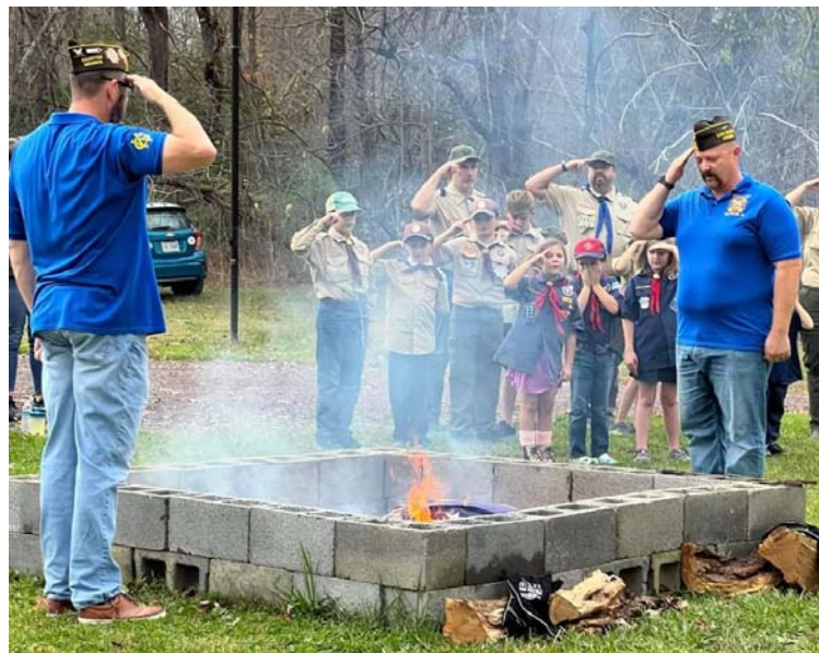
King George Post 12202 Conducts Flag Retirement ceremony during Veterans Day events