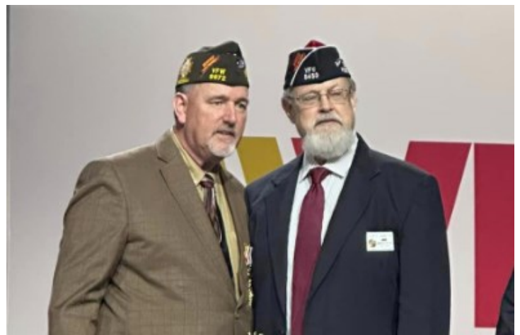
JEFF CARROL / DEPT of GA