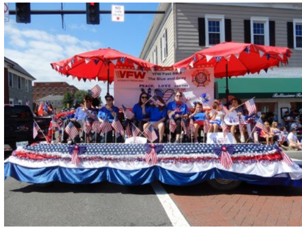
Post parade float used for members that cannot march, Auxiliary, and some children