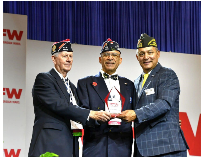
VFW VA FACEBOOK