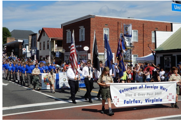
VFW Post 8469 Color Guard and Marching Unit on Main St, Fairfax VA

This post does not have a canteen nor does it do charitable gaming. Rather, it focuses on service projects and continues to grow each year with an eclectic membership.