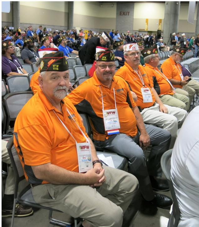
PSC DOC CROUCH