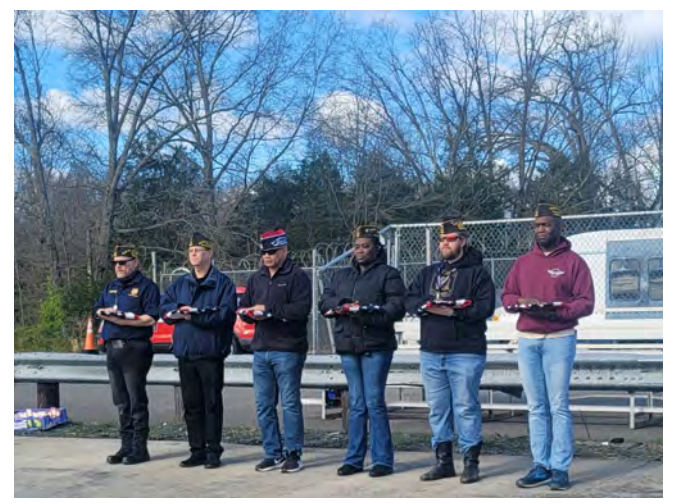
Comrades from each of the branches of service, stand by to retire a flag for the official ceremonial start.