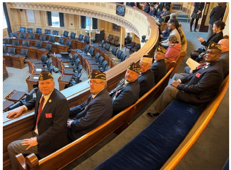
The VFW team was recognized at the House of Delegates session