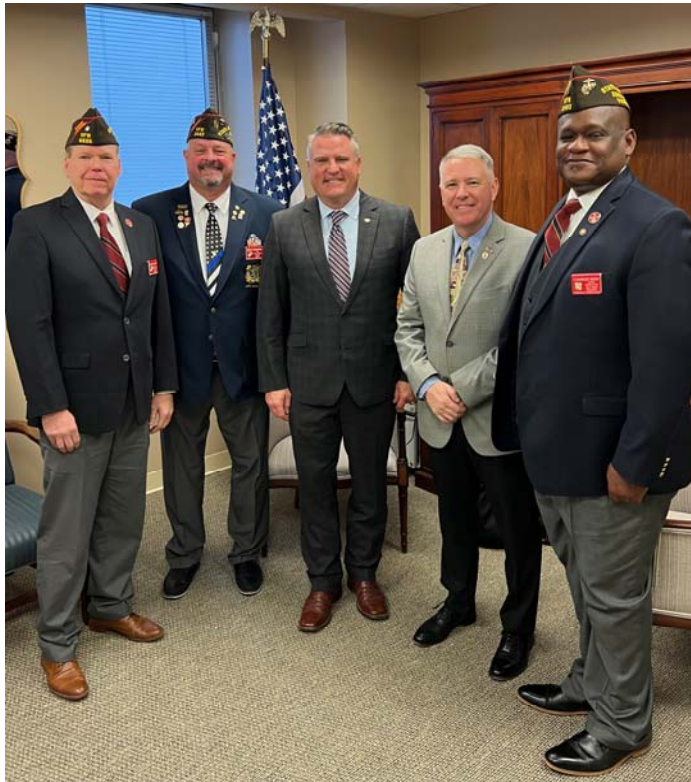
Meeting with Senator Bryce Reeves (center)

The following pictures were from lobbying the State Legislature about charitable gaming and also recognizing us for our Centennial and 100 years of service to Virginia's veterans during a session of the House of Delegates