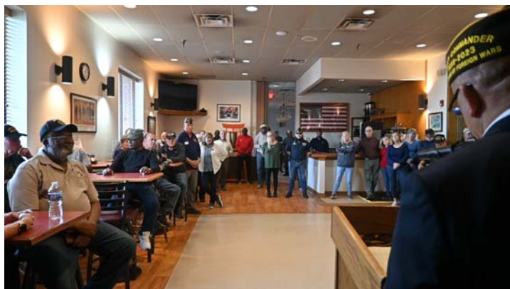
A large number of Comrades and Auxiliary attended the ceremony.