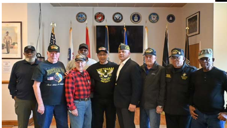
A few Vietnam Veterans pictured with the Post Commander.