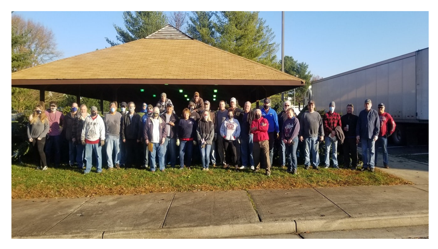
Post Comrades and Auxiliary came out in force to assist in the offloading of the 386 Christmas trees for Post 1503. According to some of the volunteers, it was more difficult this year, due to the additional mask requirement. Thanks COVID-19.