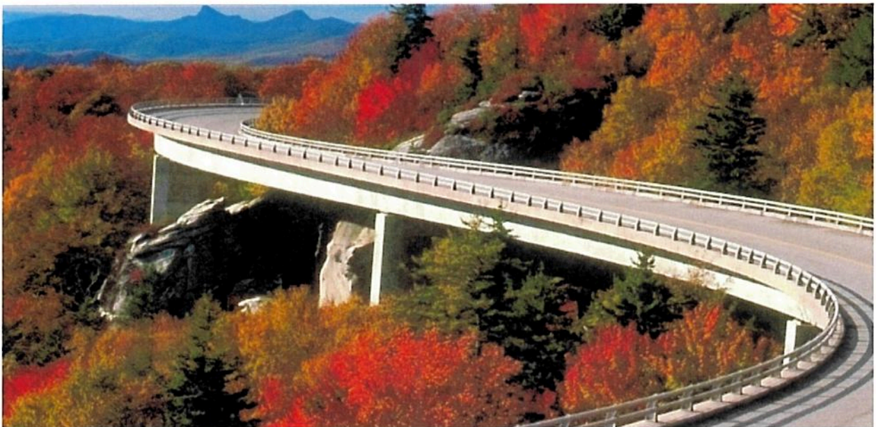
Travel Along The Beautiful Blue Ridge Parkway (free)