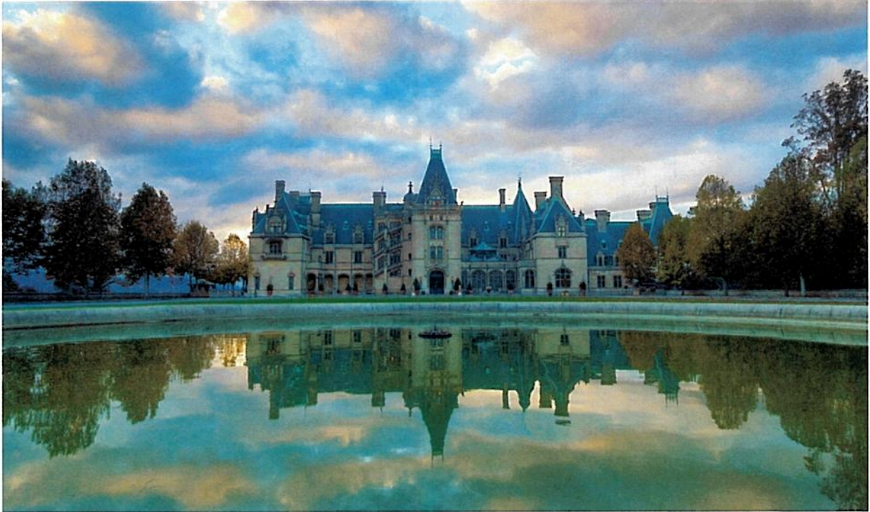
The Famous Biltmore Estate, America's Largest Home (admission fee)