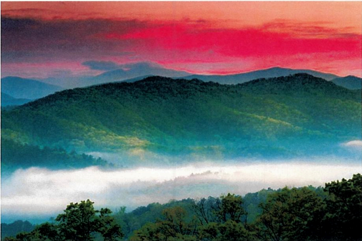
Great Smoky Mountains National Park (one of the only National Parks with no admission fee)