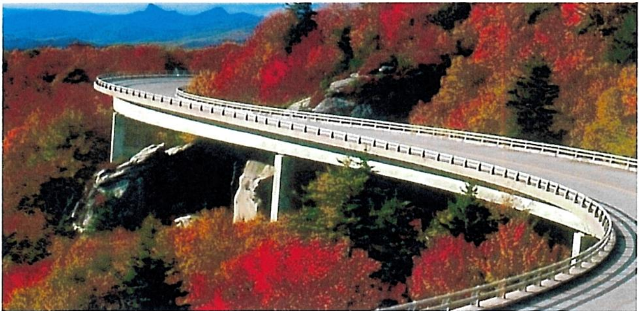
Travel Along The Beautiful Blue Ridge Parkway (free)