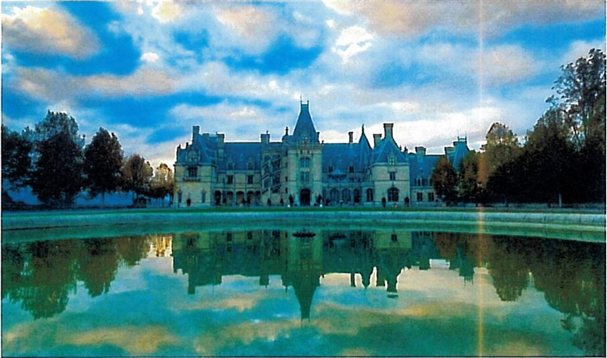
The Famous Biltmore Estate, America's Largest Home (admission fee)