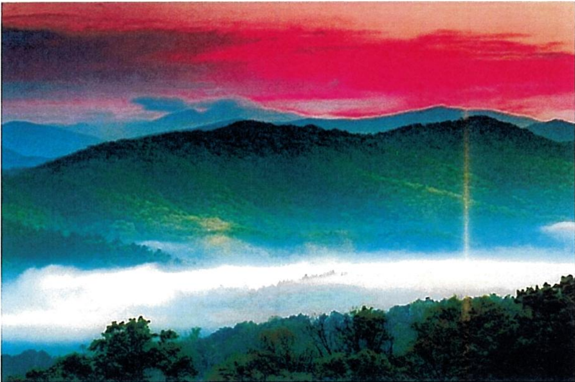
Great Smoky Mountains National Park (one of the only National Parks with no admission fee)