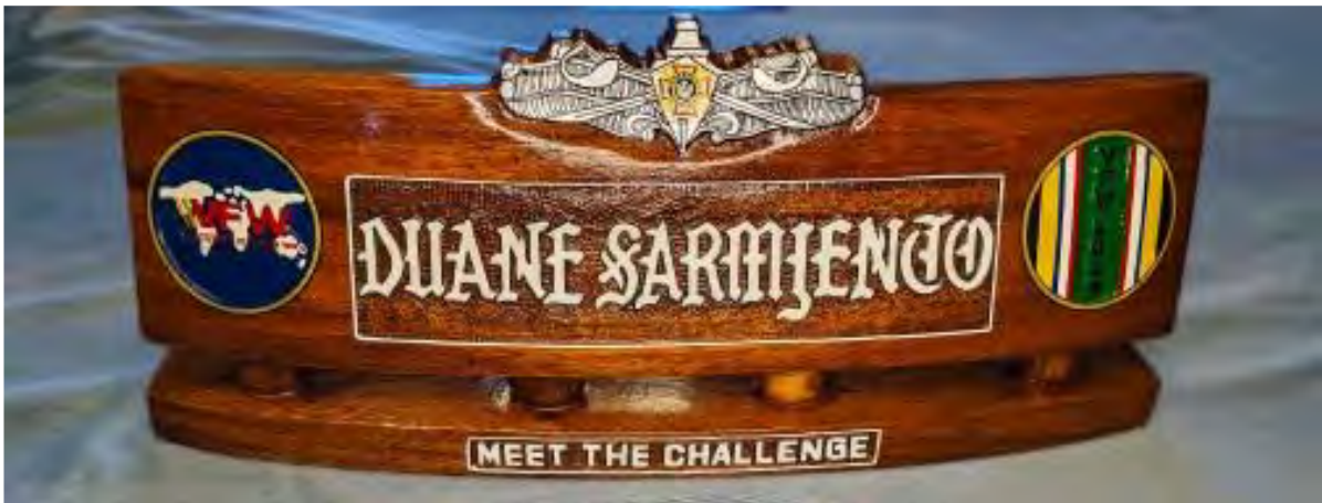
CIC Desk Name Plate (Award winners name with CIC logo and slogan )