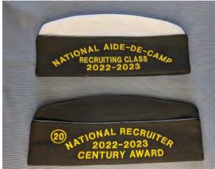
Aide-de-Camp Cap and Century Recruiter Cap