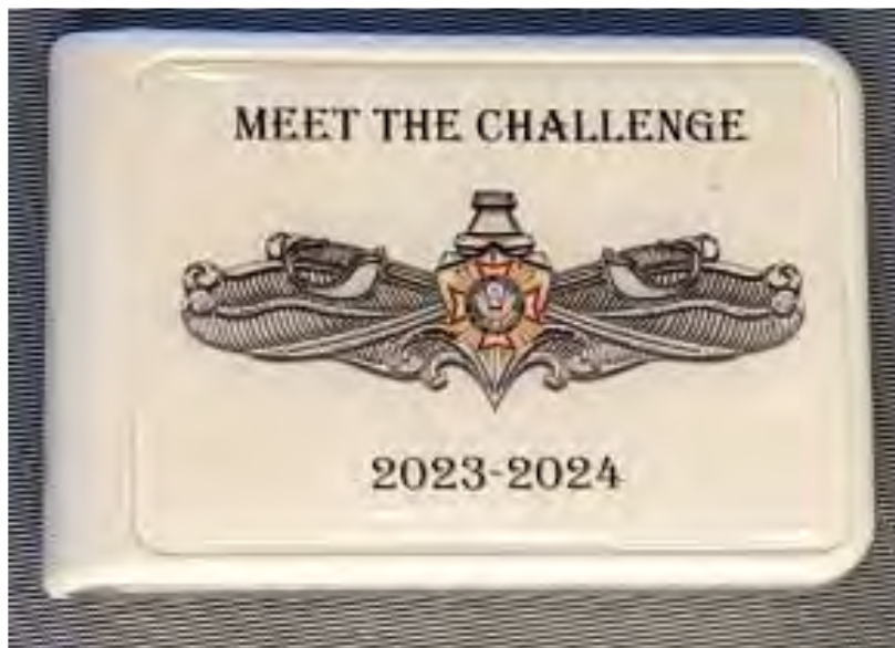
CIC logo power bank