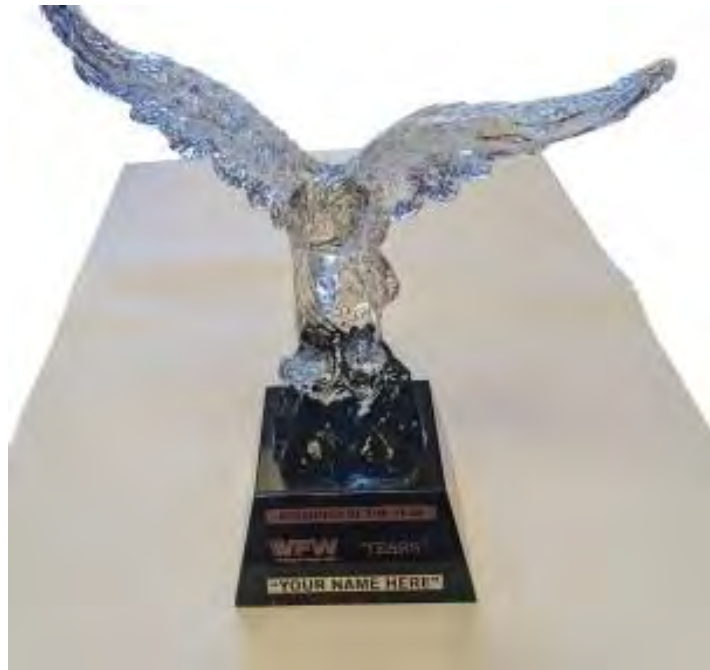
Recruiter Of The Year – Crystal Eagle trophy