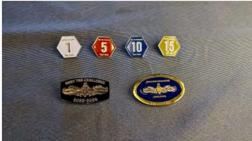
1-, 5-, 10-, and 15-member Recruiting Pins Commander-in-Chief's Pin and Coin