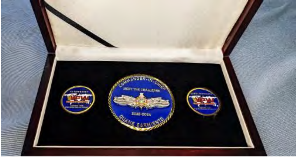
CIC Medallion Set with SVC and JVC Coins