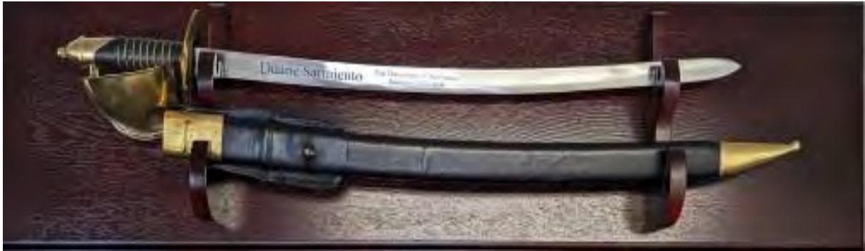
Engraved Navy Cutlass