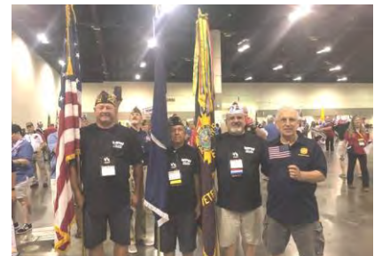
AT THE PATRIOTIC RALLY