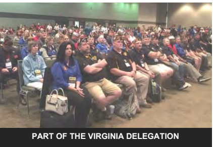
PART OF THE VIRGINIA DELEGATION