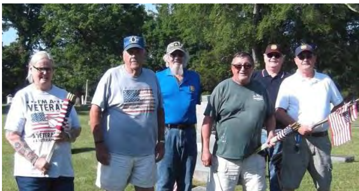
On the morning of Memorial Day a group VFW 7059 members and Auxiliary attended the excellent program at the Amelia Veterans Cemetery. Members placed a commemorative wreath.

Just a note to thank all who participated in our busy Memorial Day activities. We had great member and Auxiliary turnouts for all of our events which we kicked off by placing flags on the graves of our fallen comrades - Fred Hill