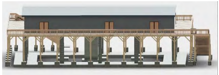
Model of planned new Post

VISIT www.vfw1860.org TO DONATE AND ENTER THE RAFFLE!