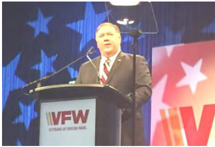
SECRETARY OF STATE MIKE POMPEO