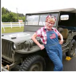
Rosie The Riveter