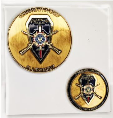
Commander-in-Chief Medallion and Coin

Below you will see examples of some of the awards and items mentioned in this program. For more information, contact the VFW Membership Department.